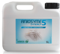
Aniosyme Synergy 5 5 L can Order code: 2235.015