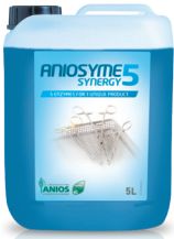
Aniosyme Synergy 5 5 L can Order code: 2235.038

UNIQUE 5-enzymatic cleaner for holistic manual and automated reprocessing